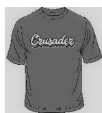
PPCA Script Bubble Women's Shirt

Adult: S____ M____ L____ XL____ XXL____ XXXL____