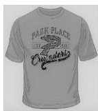
Park Place Electric P Shirt

Adult: S____ M____ L____ XL____ XXL____ XXXL____