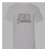
PPCA Leopard Women's Shirt