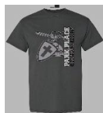
PPCA Sideways Shirt

Adult: S____ M____ L____ XL____ XXL____ XXXL____