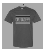
Park Place Friday Shirt

Adult: S____ M____ L____ XL____ XXL____ XXXL____