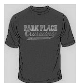
PPCA Pixel Shirt

Adult: S____ M____ L____ XL____ XXL____ XXXL____